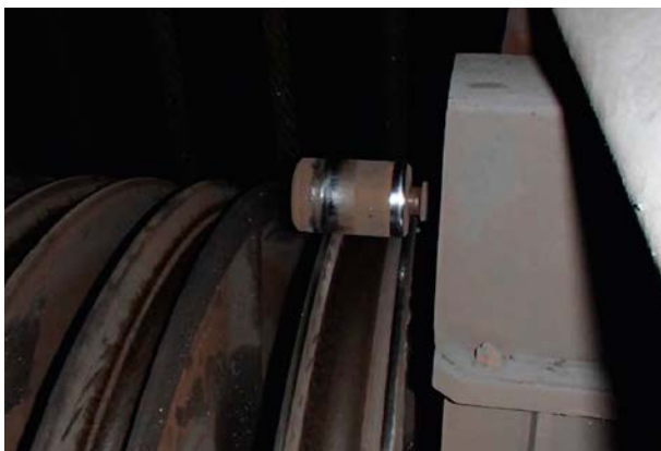
The energy for battery charging is generated from the lifting movement of the crane by a rotating sheave at the rope pulleys.